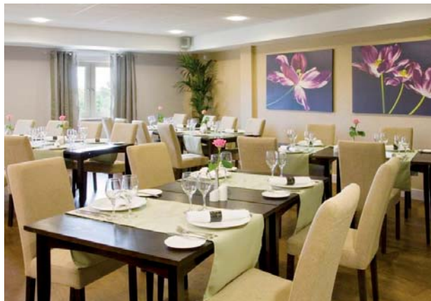
The Restaurant, Cadbury House Limited.

The Company achieved its 70% qualifying status in the current financial period, and as a result the Board expect to concentrate in the future on the monitoring of our existing investments, rebalancing its non-qualifying investments to reflect changed market circumstances and considering the options for exits.