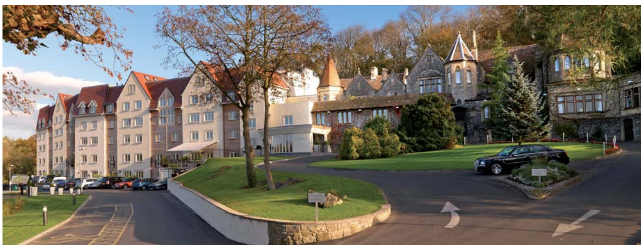
Cadbury House Limited.

“We remain cautious about the state of the economy and the duration of the current recession. The values of most types of asset already reflect the prospects for a long recession and with the reluctance or inability of banks to advance new credit, the environment remains challenging. This may reduce the collateral value supporting some of our secured loans and slow the progress in achieving successful realisations in preparation for the end of the VCT’s life. Notwithstanding this, there is good potential to deliver a satisfactory post-tax return to investors which should outperform most other investments made over a similar period.”