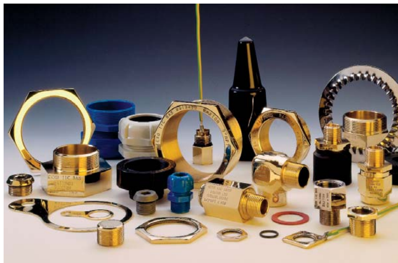
Mount Engineering plc.

During 2008, the VCT held significant sums in bank commercial paper on which we achieved satisfactory returns. Since the sharp fall in interest rates, we have invested some of the balance of the VCT's portfolio in reasonably liquid, better yielding corporate bonds with short maturity, of investment grade or close thereto. In the same vein, the VCT has purchased a diversified portfolio of corporate bond funds holding a broader range of similar credits. As stated above, we reduced holdings in hedge funds to a lower level – the remaining hedge fund holdings are generating a positive return.