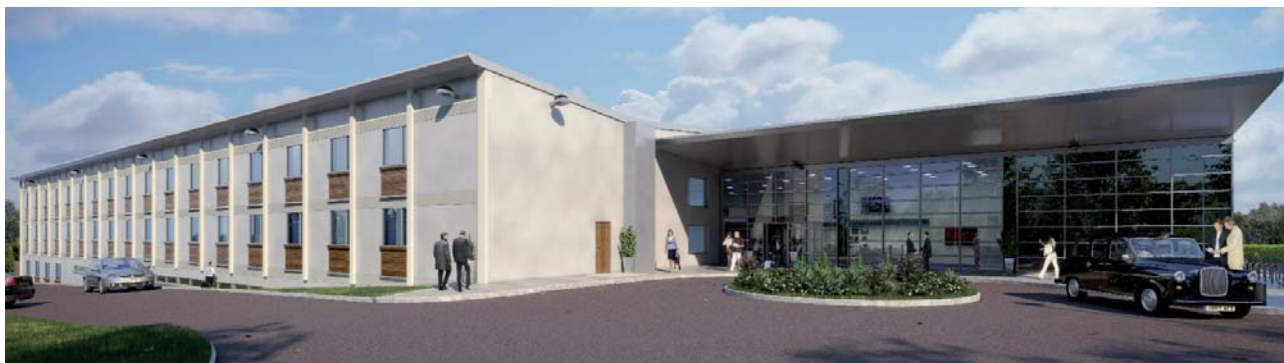
The Holiday Inn hotel in Winchester, being built by Bond Contracting Limited.

Puma VCT IV has invested £1.0 million in Bond Contracting Limited up to period-end including £394,000 in the last financial period. Bond Contracting was set-up to operate as a contractor within the leisure sector and actively sought to enter into contracting arrangements during the period. It has entered into a contract as master contractor to build a 141 room Holiday Inn hotel on the outskirts of Winchester. The VCT has made an additional investment in Bond Contracting of £182,000 subsequent to the period-end.