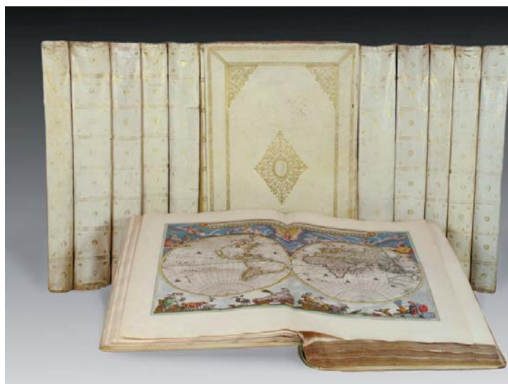
The Puma VCTs have invested in the parent of Bloomsbury Auctions, international auctioneers of rare books.

As at the period end, the listed qualifying holdings made up approximately 3% of total qualifying holdings and about 2% of the entire portfolio. Within this, the largest components are Mount Engineering plc and Vertu Motors plc, accounting for 71% of total AiM listed