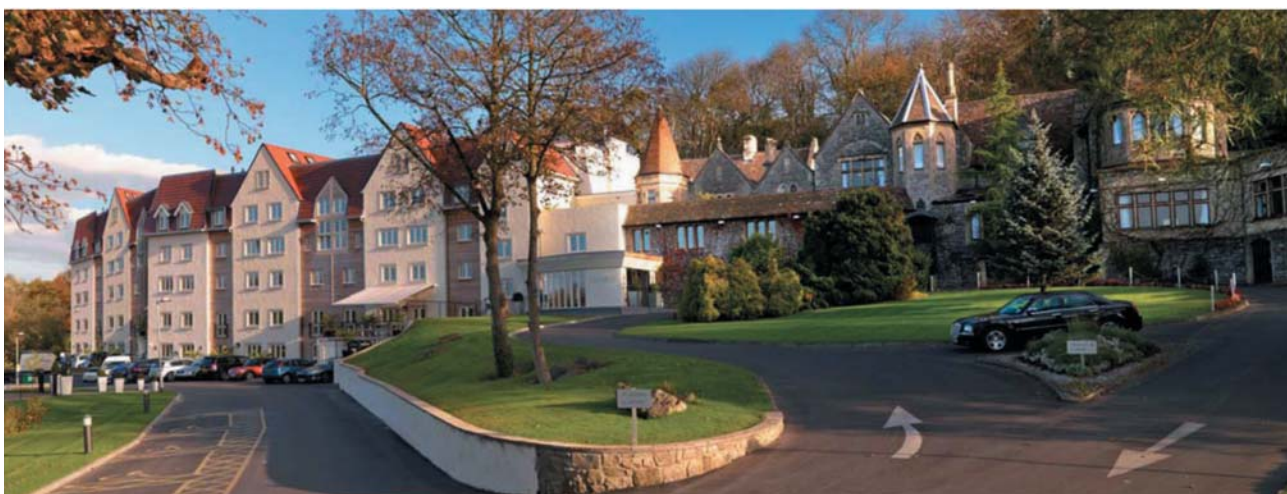
Cadbury House Limited.

“I am pleased to report upon a successful year for the VCT in which it achieved major progress in fulfilling its objectives. Several significant unquoted qualifying investments were realised successfully and the interim dividend of 10p is a continuing part of the process of returning capital to investors. The VCT continues to progress the realisation of its portfolio and the Board anticipates commencing the winding up of the fund on schedule in the summer of 2011.”