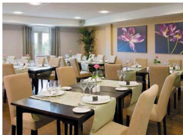
The Restaurant, Cadbury House Limited.

Puma VCT III plc invested a total of £2.2 million in Bond Contracting Limited ("Bond"). Bond was set-up to operate as a contractor within the leisure sector and actively sought to enter into contracting arrangements. It entered into a contract as master contractor to build a 141 room Holiday Inn hotel on the outskirts of Winchester which was completed in January 2010 and subsequently sold. Upon the sale of the hotel, Bond received full settlement of the contracting costs plus a margin. Upon receipt Bond redeemed in full its loan notes with the VCT. Including the value of the remaining