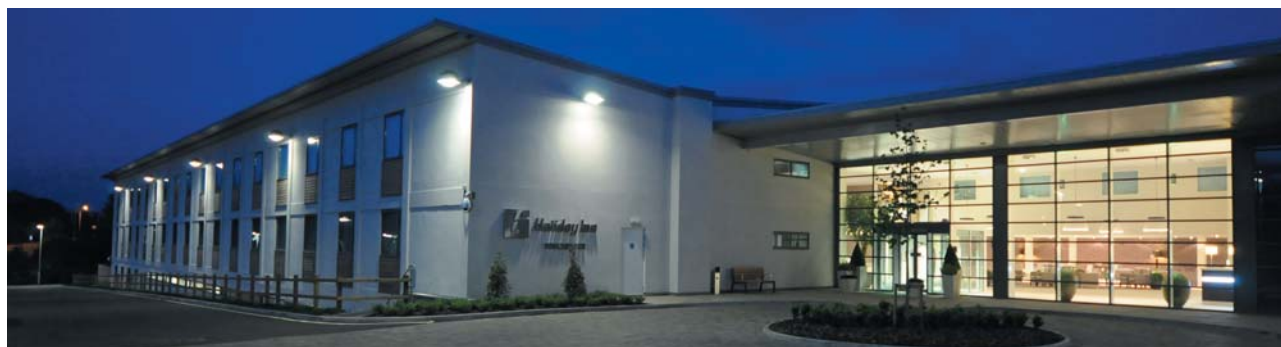
The Holiday Inn Hotel in Winchester, built by Bond Contracting Limited.

In last year's annual report and accounts to 28 February 2009 we discussed that the VCT had invested £6 million into a number of qualifying companies which are actively pursuing opportunities for significant qualifying business. We are pleased to report the £2 million of this, invested into Albemarle Contracting Limited and Heddon Services Limited, has been invested into Forward Internet Group, as discussed above. The remaining four companies which comprise the balance of the £6 million continue to pursue such