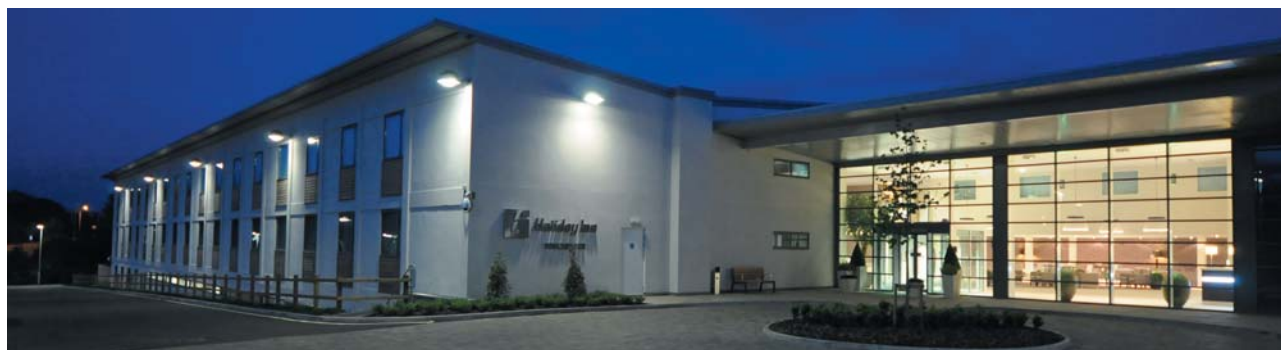
The Holiday Inn hotel in Winchester, being built by Bond Contracting Limited.

The fund's holding in Clifford Contracting Limited of £1.1 million was sold in June 2009 to Telford Homes plc in exchange for new shares and secured loan notes. In accordance with the expected timetable for the VCT winding-up, Telford redeemed 90% of its loan notes with the VCT subsequent to the year end.