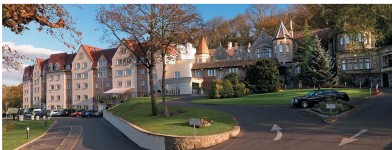
Cadbury House Limited.

In accordance with the 2005 Prospectus, the Board is tabling resolutions to wind-up the VCT as it has now just passed its fifth year. The intention is to return a large part of the residual capital in the near term, with an orderly wind-up of the VCT within the two years envisaged by tax legislation.”