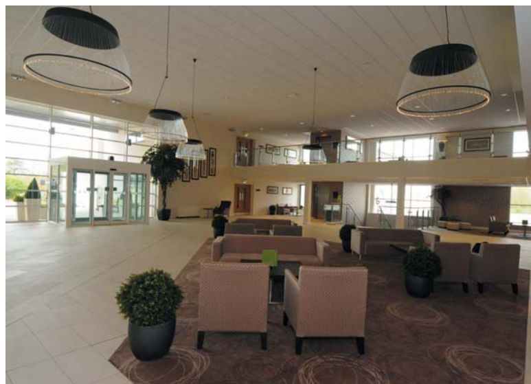
The Holiday Inn Hotel in Winchester, built by Bond Contracting Limited.

Our hedge fund allocations continue to perform strongly. We retained a position in BlackRock, an equity fund which has delivered positive returns in all market environments. Additions to the portfolio during the year include BH Macro, a closed-end listed fund