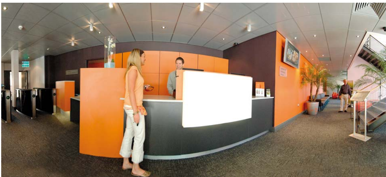
The Club, Cadbury House Hotel and Country Club plc