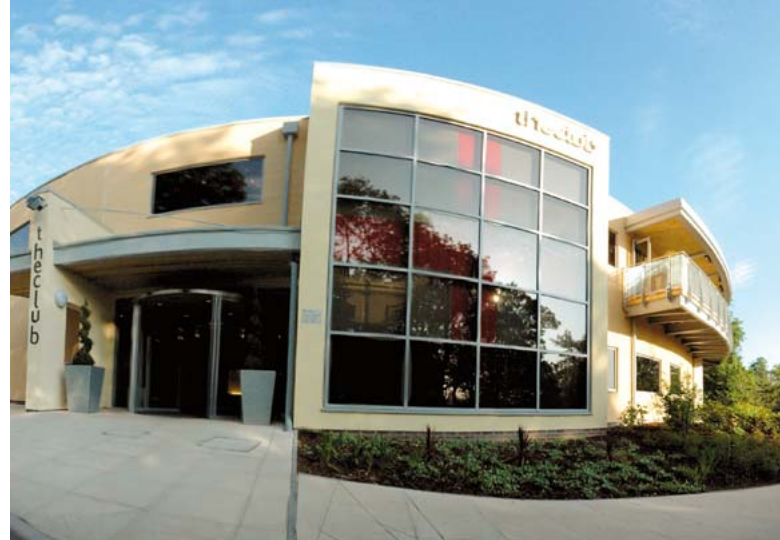
The Club, Cadbury House Hotel and Country Club plc

Puma VCT IV plc invested £164,000 in Interactive World Plc in May as part of its fundraising on admission to AiM. Interactive World is a digital content provider, principally to mobile phone handsets. It has an exclusive agreement with the Sports Group and therefore differentiates itself from other content aggregators and distributors. In addition, the business is highly cash flow generative and the offer was at an attractive valuation. The company trades on an attractive yield and we expect further share price appreciation.