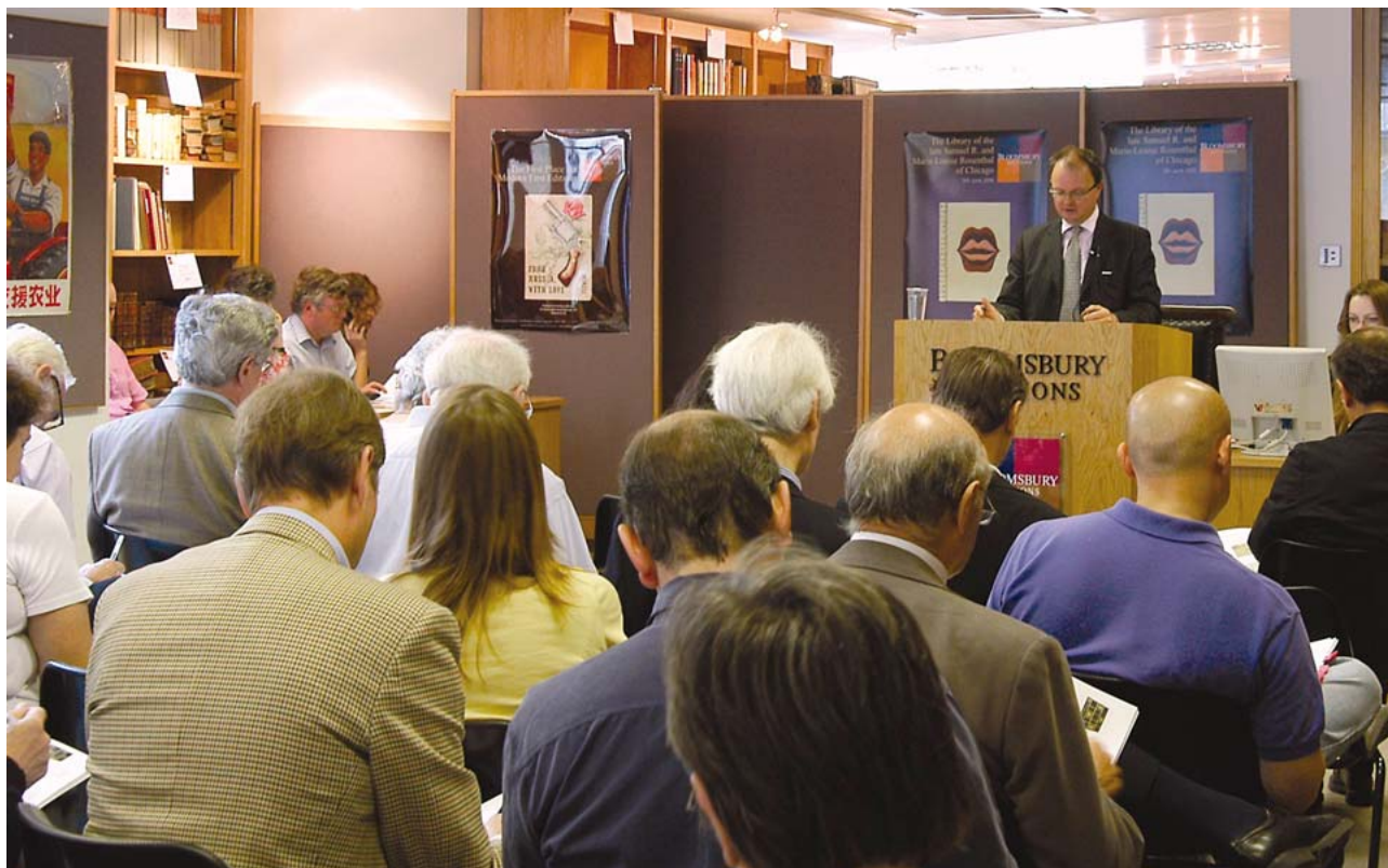
Auction in progress, Bloomsbury Auctions, subsidiary of Stocklight Limited

JPMF European Dynamic Long Short is a hedge fund with a long/short equity investment strategy. It benefits from stock selection strategies to profit from rising share prices on the long picks and falling share prices from shorts. Market exposure is variable