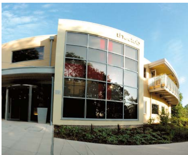
The Club, Cadbury House Hotel and Country Club plc

In June 2005 Puma VCT II plc participated in a £4 million equity investment in Cadbury House & Country Club plc. Since then the company has performed well. The health club opened on time in May 2006 and impressively grew its membership from 1,600 to over 3,000 at the year end (ahead of forecasts). The banqueting and conferencing facilities were also developed to budget in time for a busy summer of weddings, which led to a successful Christmas period. The last stage in the development is the hotel which should be open for business in May 2007. The hotel will now be 72 rooms (from 63) and fitted out to a four star standard. We have revalued upwards our original investment in Cadbury House based on an independent professional valuation of the revised development which reflects the increase in rooms and improved rating. Given the progress made we welcomed the opportunity to invest an additional £789,000 in October, as part of a £12 million refinancing of bank debt. Although this investment will not participate in the