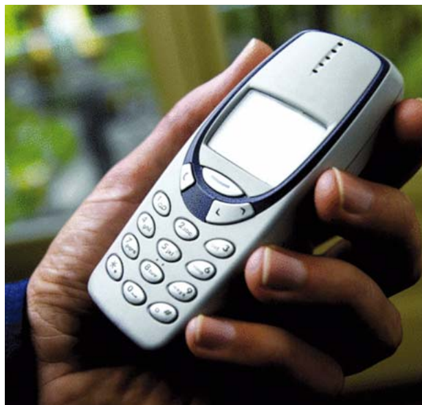
Interactive World plc

In our report for the year ending 31 December 2005 we expressed our concerns about the valuations of many of the VCT qualifying AiM IPOs, which we considered to be too high. In 2006, although our focus was still on identifying private companies, which fitted our lower risk investment mandate, we also invested in two AiM IPOs