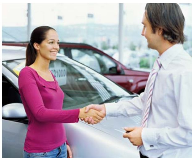
Vertu Motors plc

Puma VCT II plc retained two investments in its qualifying portfolio, completed during 2005: @UK plc and Patsystems plc. Patsystems continued to perform well during the year, picking up new clients and generally meeting market expectations. They have carved out a strong niche for themselves, providing software within the derivatives trading market, and have grown on the back of strong growth within this industry. High levels of recurring revenues should underpin the price and make it a potentially attractive acquisition target. Unfortunately @UK has proved disappointing. Despite an initial uplift