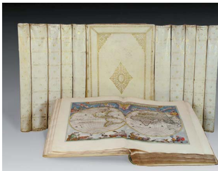
The Puma VCTs have invested in the parent of Bloomsbury Auctions, international auctioneers of rare books.

Patsystems provides derivatives trading software products and solutions to financial institutions. The company continues to perform well and recently reported that 2009 has started strongly with sales successes across all products and regions. In addition to this growth, a high proportion of revenues are recurring giving a greater predictability. Cash generation is strong and the