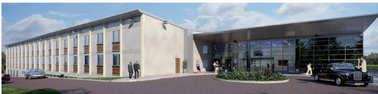
The Holiday Inn hotel in Winchester, being built by Bond Contracting Limited.

Stocklight Limited in which the VCT has invested £419,000, is a rare book dealer and the parent company of Bloomsbury Auctions, which has made progress