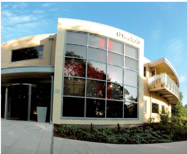
The Club, Cadbury House Hotel and Country Club plc

The Company's third AiM investment of 2006 was Vertu Motors plc. Puma VCT plc invested £593,000 as part of the £25 million fundraising in December. Vertu is pursuing a buy and build strategy in the motor dealership industry. It was an attractive opportunity for Puma VCT plc as we were backing a highly experienced management team to consolidate a fragmented industry which will be supported by substantial property assets. Vertu's first