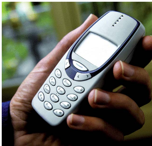
Interactive World plc

In our report for the year ending 31 December 2005 we expressed our concerns about the valuations of many of the VCT qualifying AiM IPOs, which we considered to be too high. In 2006, although our focus was still on identifying private companies, which fitted our lower risk investment mandate, we also invested in two AiM IPOs