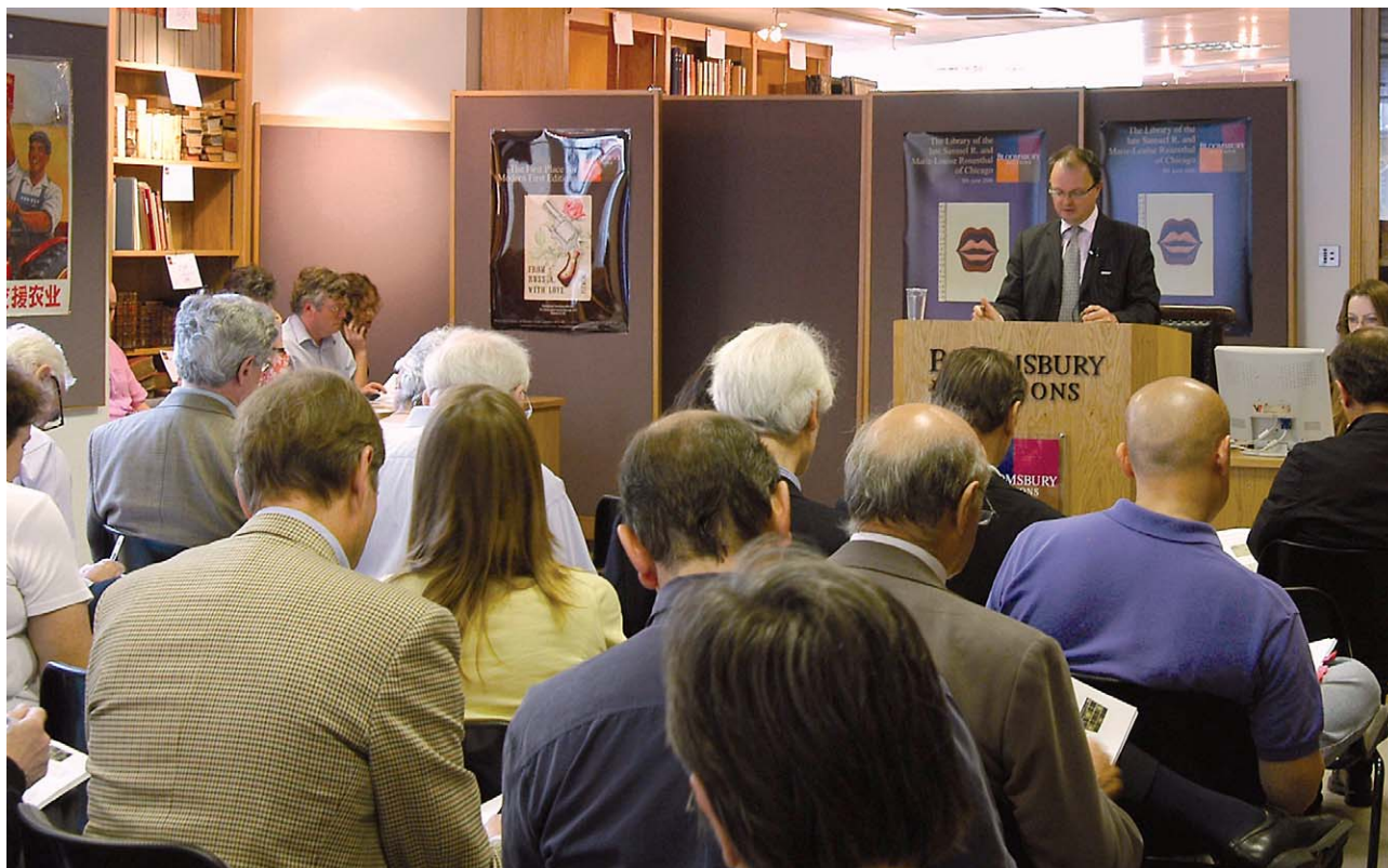
Auction in progress, Bloomsbury Auctions, subsidiary of Stocklight Limited

JPMF European Dynamic Long Short is a hedge fund with a long/short equity investment strategy. It benefits from stock selection strategies to profit from rising share prices on the long picks and falling share prices from shorts. Market exposure is variable.