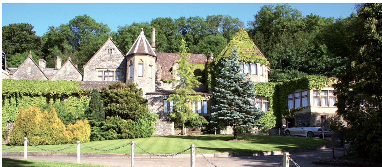
Cadbury House Hotel & Country Club plc

“The year to 31 December 2006 has shown progress with a number of qualifying and non qualifying investments contributing significantly to performance. We continue to look for qualifying opportunities which meet our criteria to ensure that we meet the minimum targets for qualifying investments of 70%. In the meantime, we are confident in the prospects for our existing portfolio of companies.”